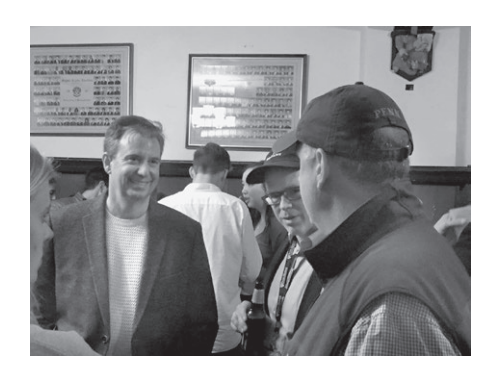
SAE alumni enjoying the post-game reception at the Chapter House after Penn's Homecoming win over Princeton.

There have been a lot of alumni reunion events recently. Weren't able to attend? Here's what our brothers have been up to: