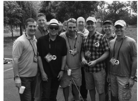
Above: Class of 1989 attendees at the Alumni Day parade. Far Left: Brothers from the Class of 1994. Left: The Class of 2004 celebrates its 10 th reunion with more than half of its brothers in attendance.