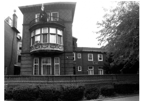
Penn Theta has a longstanding legacy at 3908 Spruce St.

about it. There's nothing we can't do as a unified brotherhood.