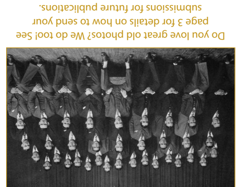
Do you love great old photos? We do too! See page 3 for details on how to send your submissions for future publications.

"'Humor for Haiti' was an excellent event as it brought together many students from all different backgrounds to meet and support a serious cause in a fun unifying atmosphere," he said.