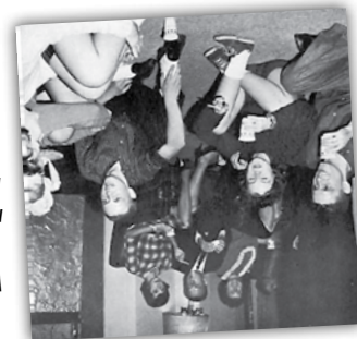
We're on a quest to find which era in our chapter's history had the most fun! See page 2 for details on how to submit the best stories and pictures from your SAE days.