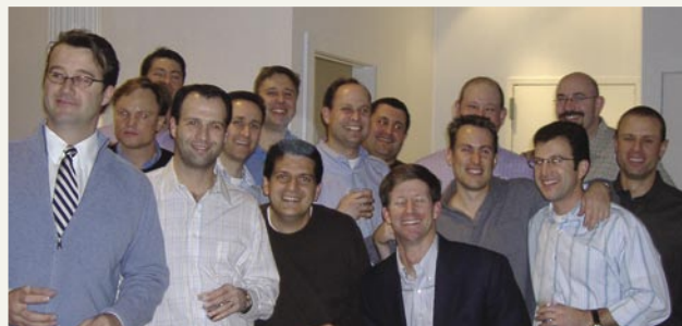
Who are these guys, and what happened to their hair?

...when you can share them with the brotherhood at www.saepath.org ?