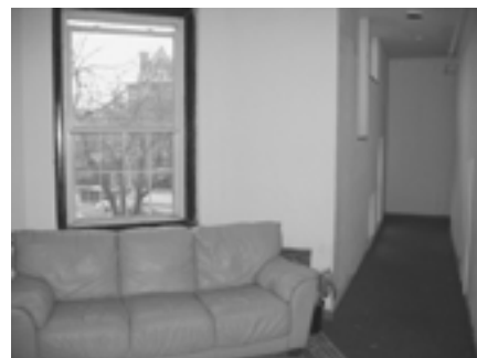
The second-floor hallway looks great after being repainted.

Improvements to the chapter house are still being made. The living room renovation has finally started and should be complete by the end of the semester. The walls are being redone with new oak paneling halfway up the walls. We will have brass wall sconces, crown molding and two brass chandeliers. We also had a house improvement day on which we repainted the hallways on the second and third floors, and gave the house a thorough cleaning from top to bottom.